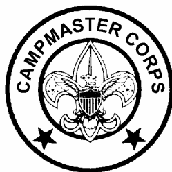
TABLE OF CONTENTS CAMPMASTER GUIDEBOOK Revised August 2008